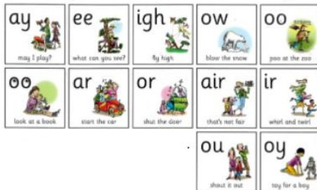
Speed Sounds Set 2