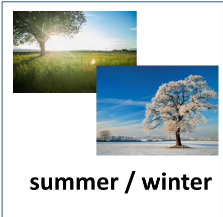
summer / winter