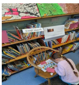
'Love' Prayer Space at St Joseph's