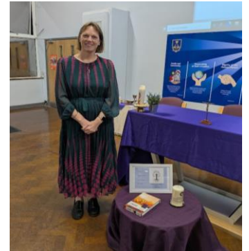
Induction and Mission Statement Launch

Pupils in Y1 and Y2 have been attending Prayer Club, at St Joseph's, after school on a Thursday. We have been praying through drawing; drawing our favourite meal or car, for example, and thanking God for what each part of the meal or car, gives us.