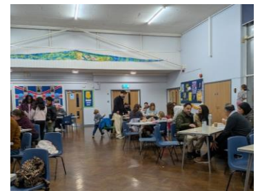
Families and Staff Quiz