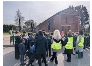
Big Lent Relay