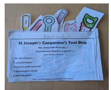
St Joseph's Feast Day