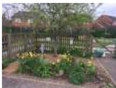
Our prayer garden

Curriculum planning takes into account the needs of individual children in line with our equality policy. The children follow a broad and balanced curriculum, our aim being to achieve continuity and progression through the school.